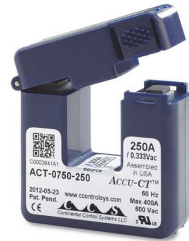
CCS Accu-CT Split-Core Current Transformer