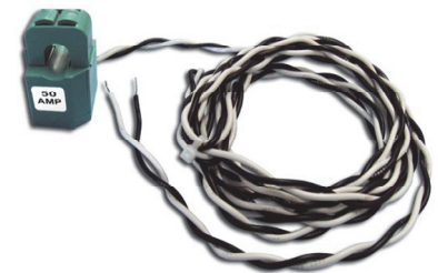
Magnelab Mini AC Current Transformer